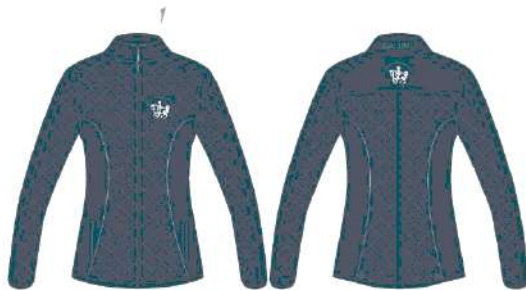
Jacket - $90

Strictly limited quantities available. Available for pickup or purchase at Festival.