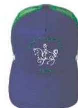
Cap - $20