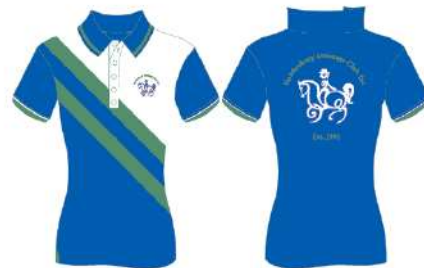
Polo - $60