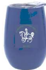
Keep cup - $22