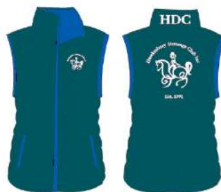
Vest - $85